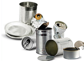
Food & Beverage Cans Latas de alimentos y bebidas