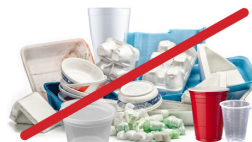
NO Foam, Plastic Cups or Plates and NO Plastic Deli Packaging NO espuma, vasos o platos de plástico y SIN envases de plástico deli