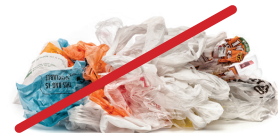
NO Loose Plastic Bags, Bagged Recyclables or Film Empty Recyclables directly into your bin NO bolsas y envolturas de plástico sueltas, o materiales reciclables embolsados Vací directamente los materiales reciclables en nuestro carrito