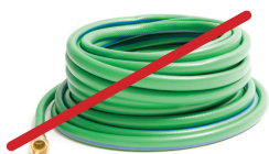
NO Tangles, Holiday Lights, Hangers & Extension Cords NO enredos, luces navideñas, perchas y cables de extensión