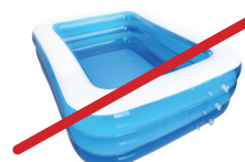
NO Non-Recyclable Plastic NO plástico no reciclable