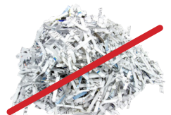
NO Paper Shreddings NO trituradoras de papel