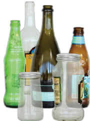
Glass Bottles & Containers Botellas y envases de vidrio