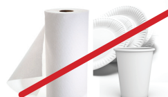
NO Paper Napkins, Plates, Cups & Tissues NO servilletas, platos, vasos y pañuelos de papel