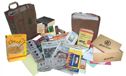
Flattened Cardboard & Paperboard Cartón y cartón aplanados