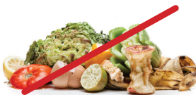
NO Food or Liquids NO comida o líquidos

KEEP THESE COMMON CONTAMINANTS OUT OF YOUR RECYCLING BIN NO INCLUIR EN SU CONTENEDOR DE RECICLAJE MIXTO