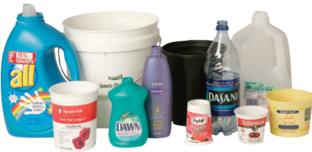
Plastic Bottles & Containers Botellas y envases de plástico